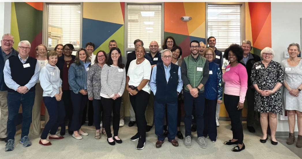
CFN Advisory Committee